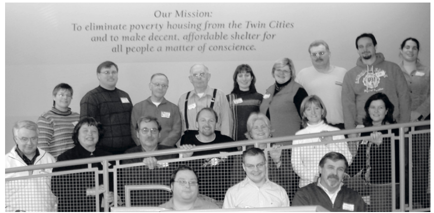
Habitat affiliate leaders in 2006

Since 1999, Habitat Minnesota has placed 223 full-year and 94 summer VISTAS with 28 Habitat affiliates across the state of Minnesota. VISTA members work with affiliates to carry out work plans designed to bring growth and change to affiliates with the ultimate goal of building their organizational capacity to serve more families. In its last year of existence (FY16), 12 full-year VISTAs were placed with 11 Habitat hosts.