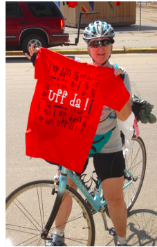
A previous Habitat 500 rider displays a t-shirt

Habitat Minnesota has helped Minnesota affiliates build 2,500 homes around the state since 1993.