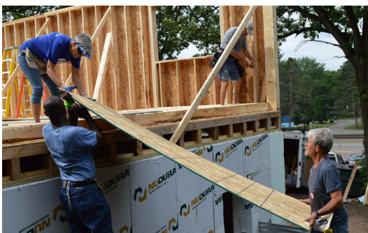
Habitat 500 participants work on the bike.home . with Central Minnesota Habitat and the future homeowner.

New Construction: From groundbreaking to final painting, Habitat staff, volunteers, and future homeowners work together to construct decent, affordable homes.