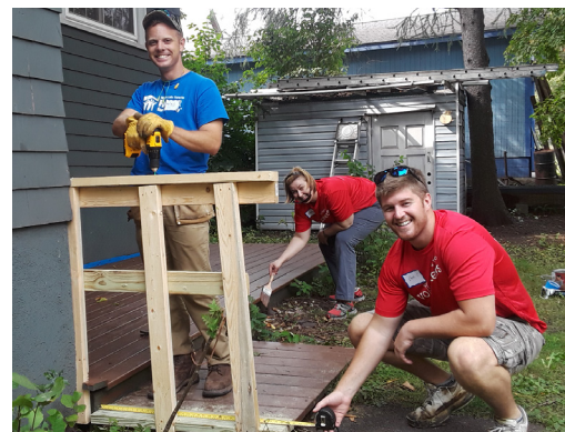
Volunteers work on a Western Lake Superior Habitat repair project.

New, recycled, and rehabbed homes increased in both Greater Minnesota and the state overall, as did total numbers for all homes built or repaired in FY18!