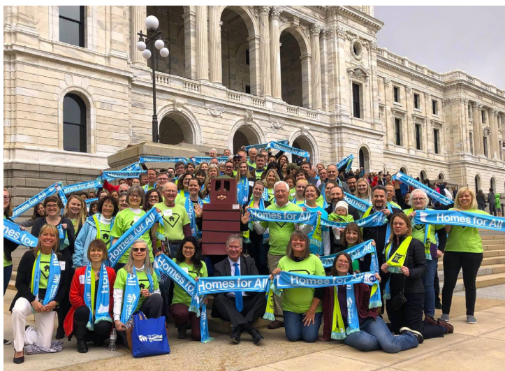
Habitat for Humanity advocates outside the Minnesota State Capitol in April 2019

These investments in Minnesota were made possible through the coalition and its supporters' hard work, including over 5,700 contacts with lawmakers (postcards, visits, emails, etc.) and 150 advocates attending the May 6th Homes for All Rally! Find more information on Homes for All here .