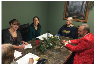
North St. Louis County home closing