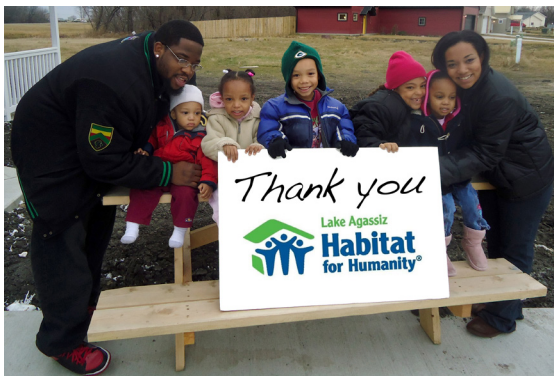
Lake Agassiz Habitat family