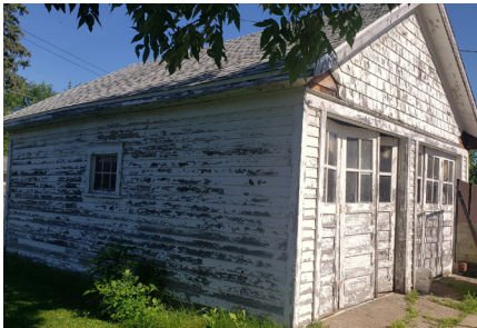
Before (above) and after (below) photos of a repair project completed by Winona-Fillmore Habitat

79% of Minnesota affiliates (22 of 28) completed at least one new, recycle, or rehab construction project in FY20 in Minnesota.