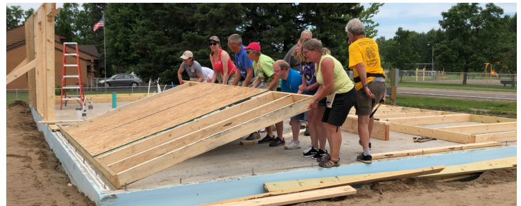
A new house under construction in West Eveleth by North St. Louis County Habitat in July 2019.