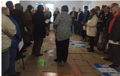
A home dedication ceremony for a recently completed house built by Rice County Habitat

75% of Minnesota affiliates (21 of 28) completed one or more new, recycle, or rehab construction projects in FY19 in Minnesota.