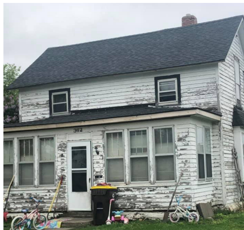
Before (above) and after (right) photos of a repair project completed by Martin-Faribault Habitat