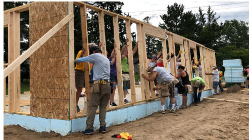
Volunteers raise walls on a home under construction with North St. Louis County Habitat during the Habitat 500 Bike Ride

75% of Minnesota affiliates (21 of 28) completed one or more new, recycle, or rehab construction projects in FY19 in Minnesota.